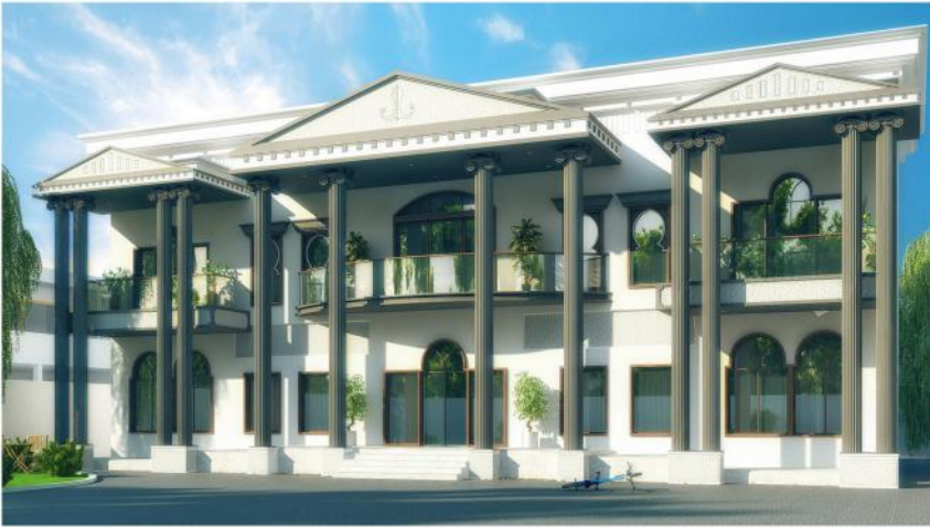
PROJECT NAME : HAFEEZ VILLA AREA : 9700 SQ.FT